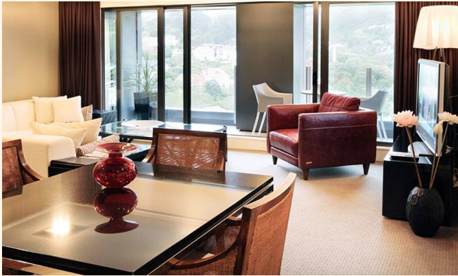
Presidential Suite , 17th floor