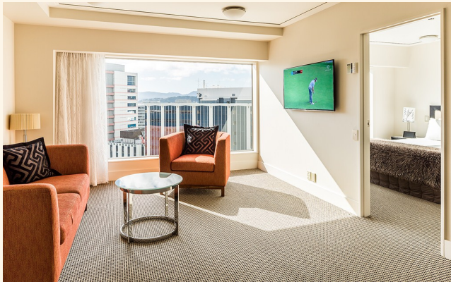
One bedroom Classic Suite