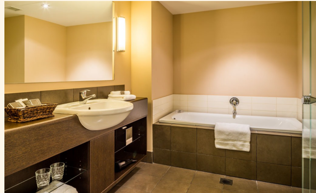
One bedroom suite