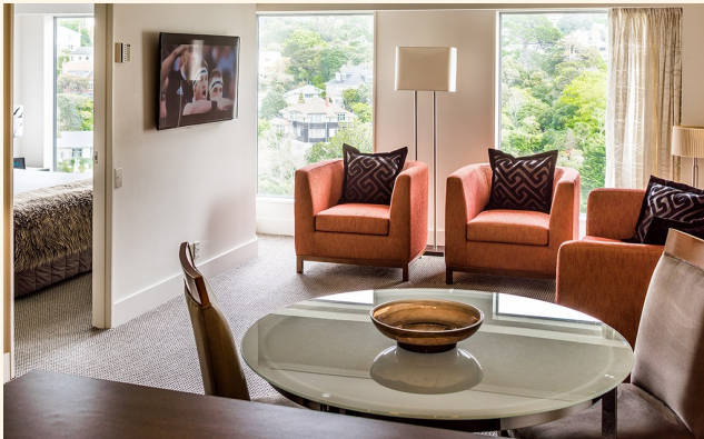
One bedroom Classic Suite